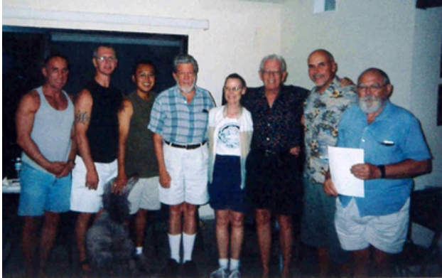
2004 Earliest photo of an Open Leadership meeting.