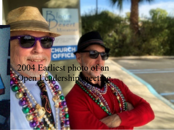
2023 Recent Open Leadership meeting.